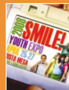
2008 Youth Expo