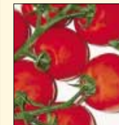
111th Orange County Fair