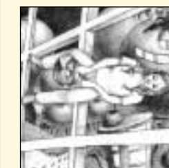
Youth Expo 2003 Clip Art Winners