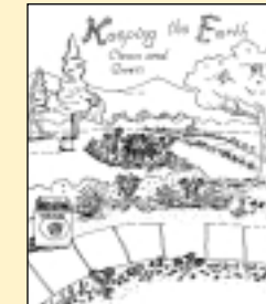
Youth Expo Clip Art