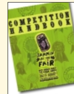
Competition Handbooks Available