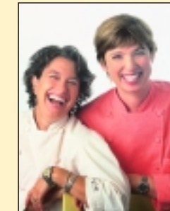
2004 Chef Series