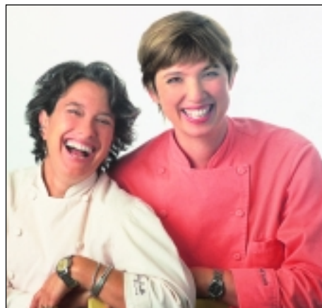
Mary Sue Milliken and Susan Feniger