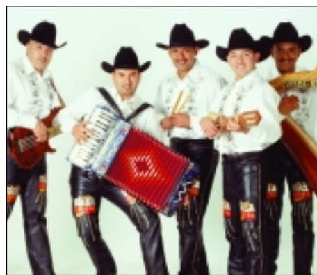
La Raza Obrera