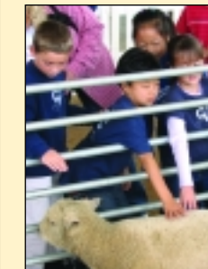
A Walk at the Farm