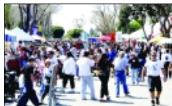
America's Family Pet Expo

Hold your next event at the Orange County Fair & Exposition Center. It's a unique combination of prime outdoor real estate coupled with more than 115,000 square feet of inviting and flexible indoor space.