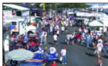
Sand Sports Super Show