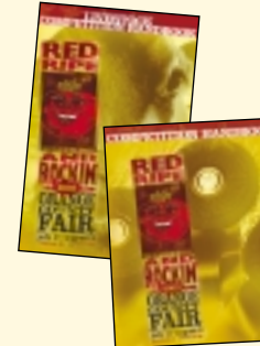
2003 Competition Handbooks