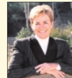
General Manager's Message