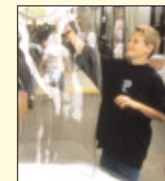
24th Annual Youth Expo